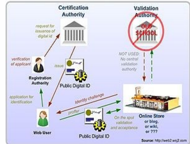
Making The Two-Way Web Safe and Scalable with Identity 2.0